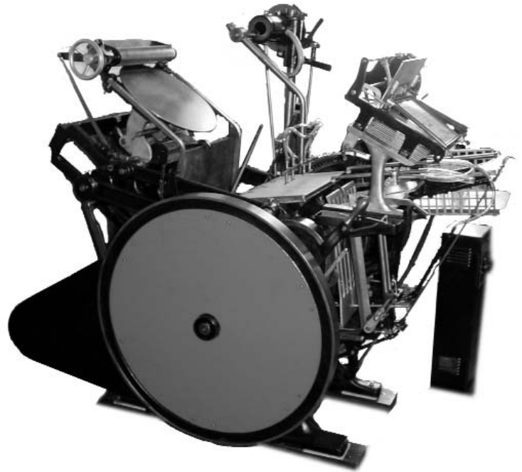
c. 1945 Kluge Press

The Brandtjen and Kluge brothers developed the first successful automatic feeder for a printing press, and in November, 1919, Brandtjen and Kluge was formed in St. Paul, Minnesota, to manufacture and sell the feeder. The Kluge Press in the Marietta Museum of History was built sometime around 1945. It is a 10x15, which means that it could print a sheet of paper up to 10 inches by 15 inches. This model printer was first introduced in 1931 and at full speed, it can print 4,000 sheets an hour.